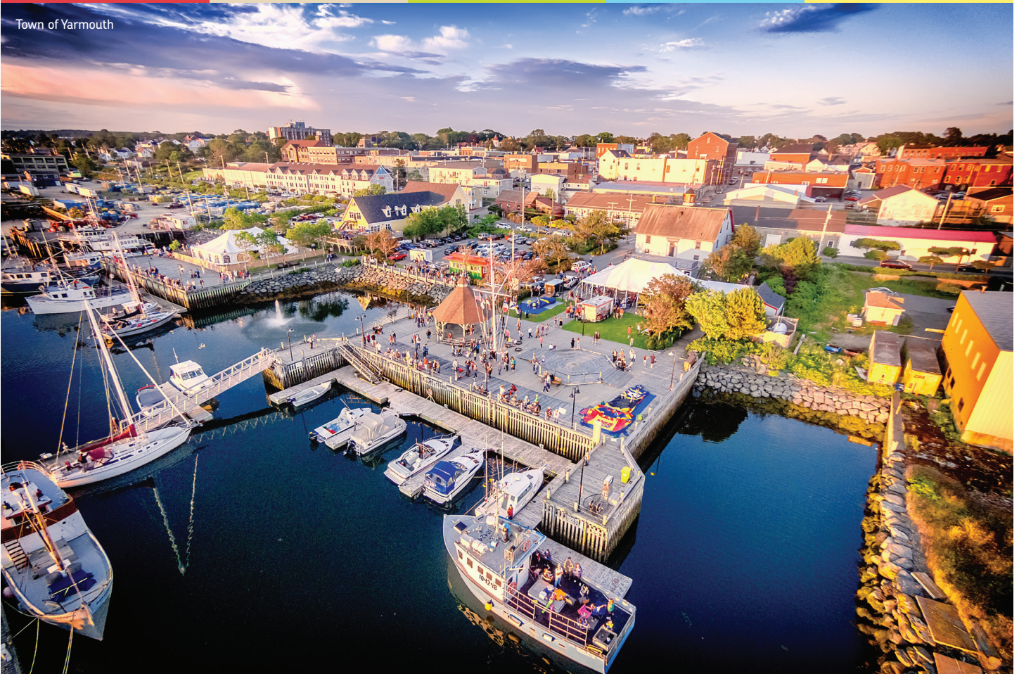
Town of Yarmouth

✦ SILVERSEA® Excursion Packages for 2020 Cruise Season